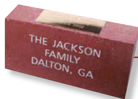
4" x 8" Red Brick Paver: $250 each

On the back of this form, check off the size of the brick(s) you are ordering, and print your message exactly as you would like it to appear. Please print clearly. All information must be complete to process your order. Replicas can be shipped only in the U.S. to a street address. Make a copy of this form if you are ordering more than one brick per size.